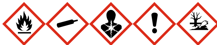
Flame Gas cylinder Health hazard Exclamation mark Environment